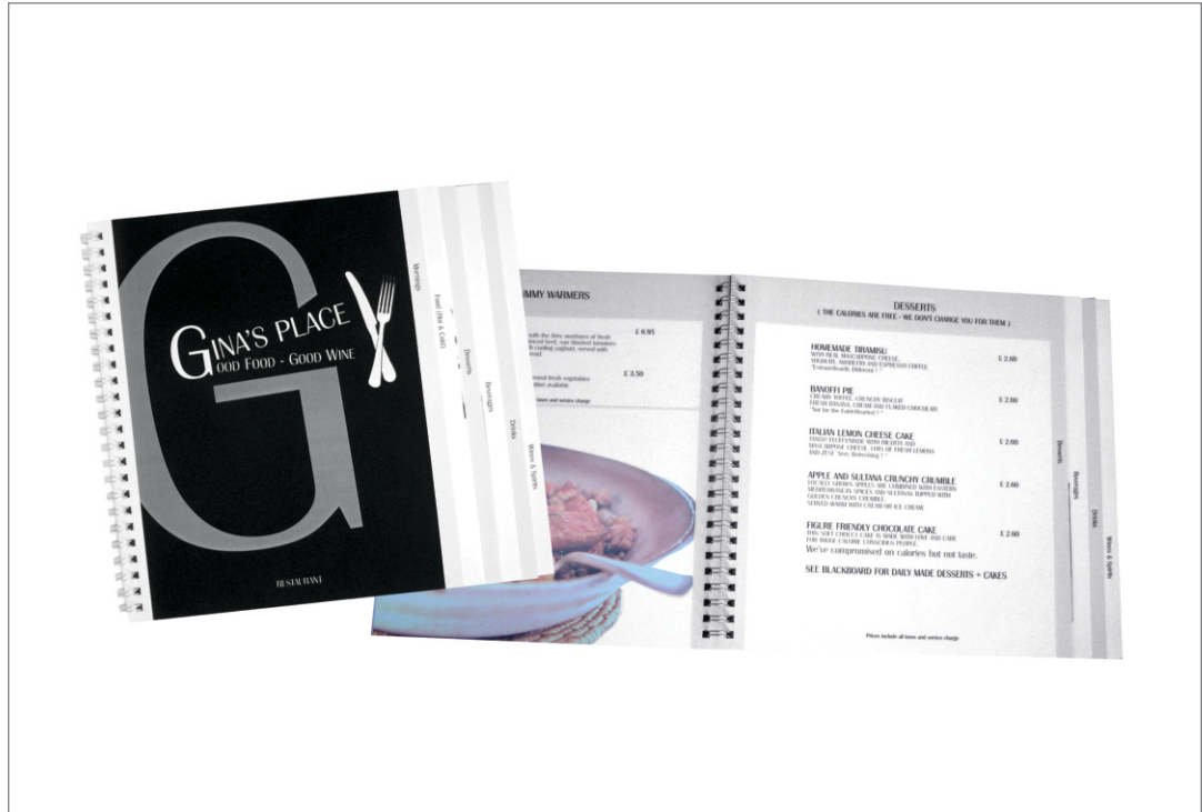
Client: Gina's Place Description: Main Menu Material: Paper