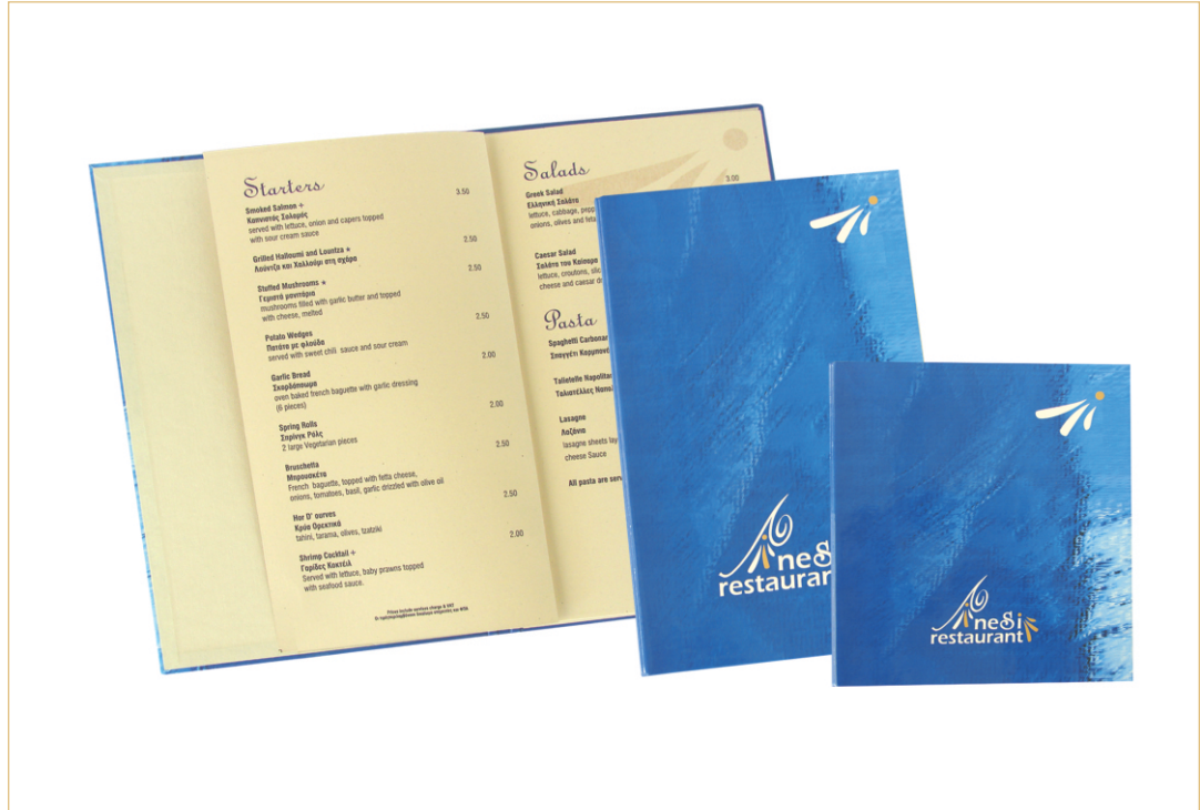
Client: Anesi Restaurant Description: Main Menu /Snack Menu Material: Paper - Hard Cover