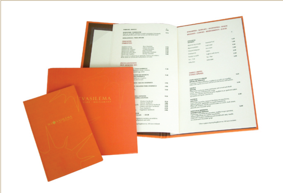
Client: ilivasilema Description: Main Menu / Café Menu / Bill Holder Material: Paper - Hard Cover