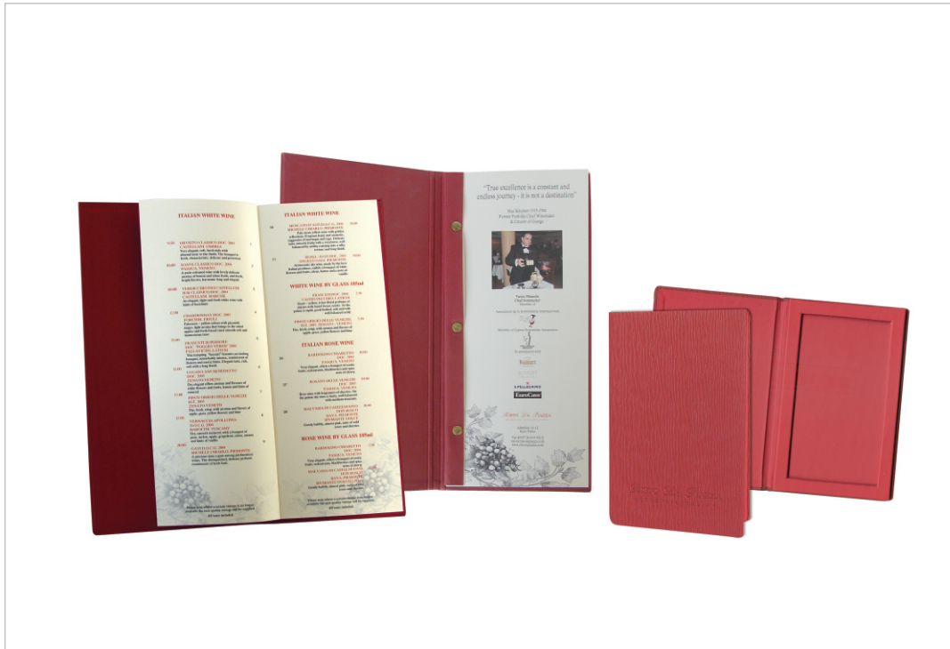
Client: Risto La Piazza Description: Wine List / Bill Holder Material: Imitation Leather - "A" Quality