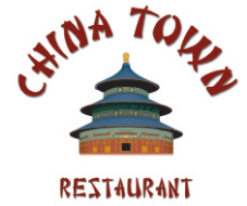
Client: China Town Restaurant Description: Dessert & Hot Beverage Menu Material: Paper