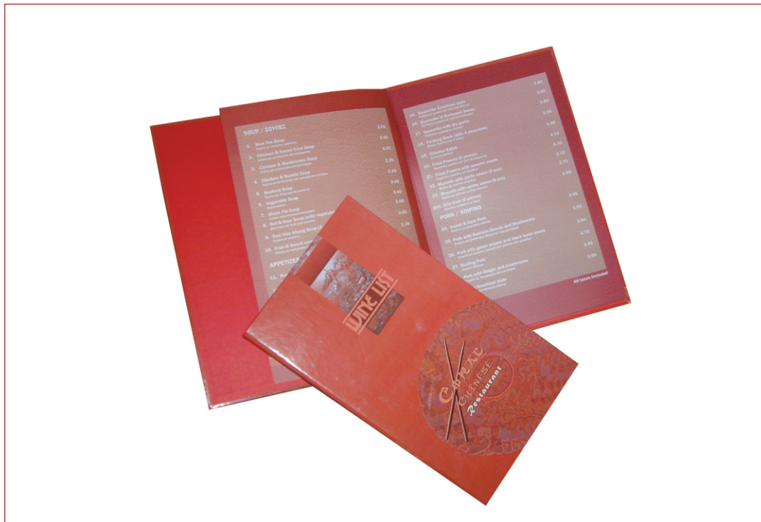
Client: Coral Chinese Restaurant Description: Main Menu / Wine List Material: Paper - Hard Cover