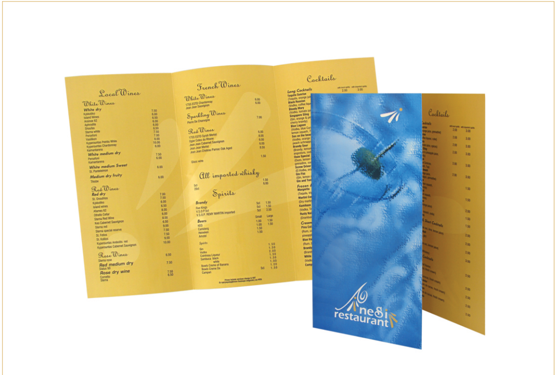
Client: Anesi Restaurant Description: Drinks Menu Material: Paper