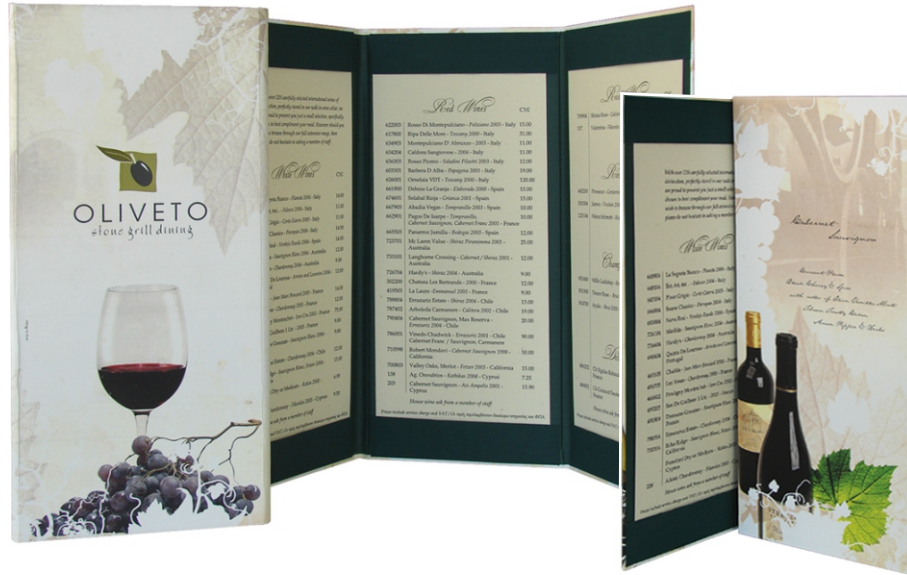
Client: Oliveto Description: Wine List Material: Paper - Hard Cover