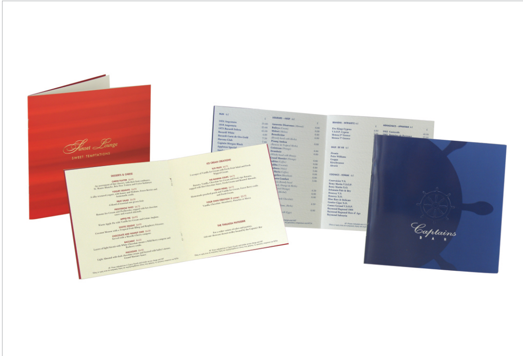
Client: Thalassa Hotel (Captains Bar / Sunset Lounge) Description: Bar Menu / Dessert Menu Material: Paper